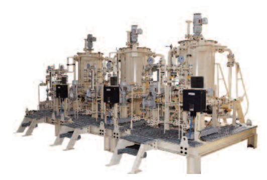
Chemical Injection Package