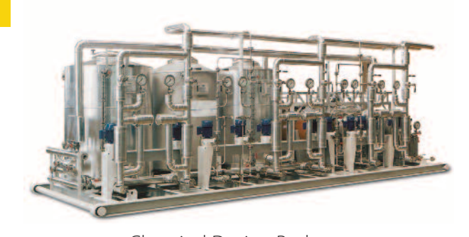
Chemical Dosing Package.