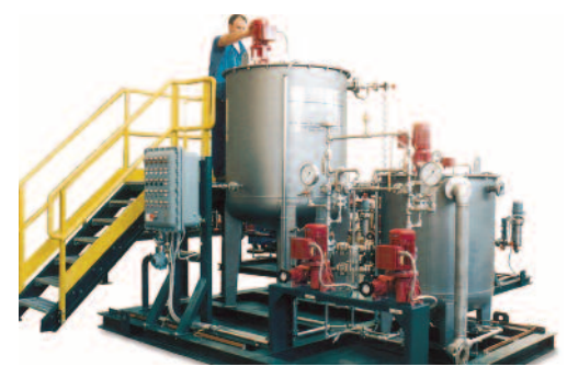
Phosphate Injection Package