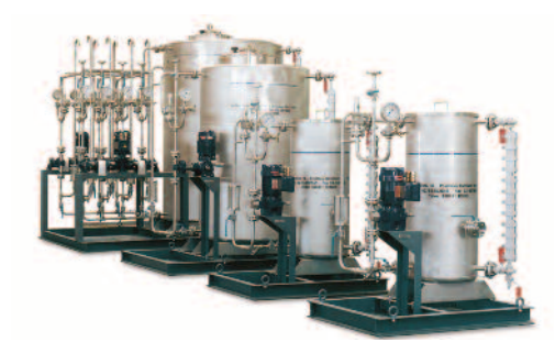
Phosphate, Oxygen Scavenger, Amine and Corrosion Inhibitor Dosing Packages

Spare parts are available on stock for 10 years after the goods delivery. After 10 years, spare parts remain available upon specific request, for the entire lifetime of the equipment.